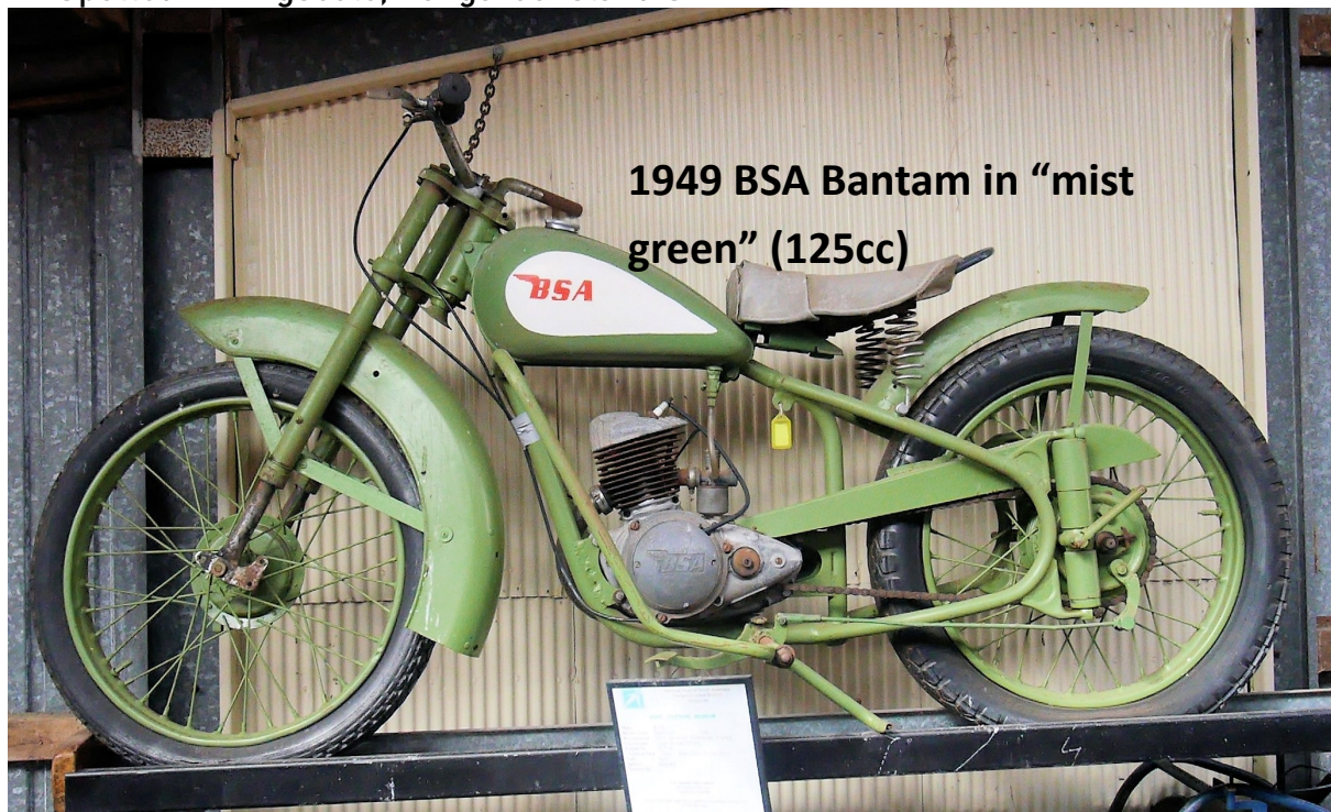
1949 BSA Bantam in “mist green” (125cc)

Spotted in Kingscote, Kangaroo Island SA