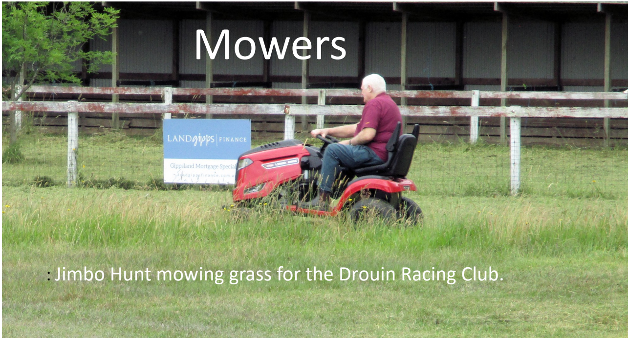
: Jimbo Hunt mowing grass for the Drouin Racing Club.